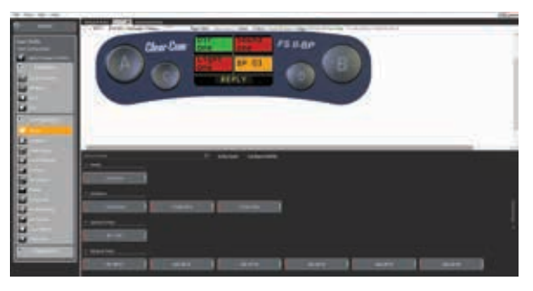
FreeSpeak II Beltpacks are configured within the EHX (Eclipse HX Configuration Software). They benefit from all the features within the Eclipse HX matrix system.