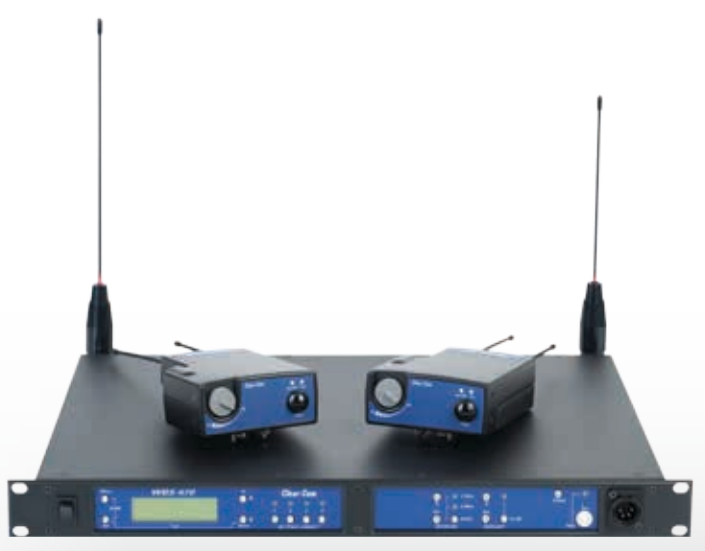
WBS670 Single channel

WBS comes in a single channel (WBS-670) or dual channel (WBS-680) option, with each base station supporting up to four full-duplex wireless beltpacks. The WBS-680 base station provides two separate channels for 2-wire or 4-wire connectivity.