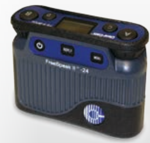
FreeSpeak II 2.4GHz