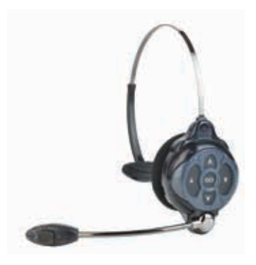
WH410 All-in-One Headset